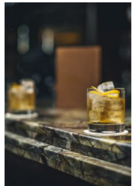
LE PONT DE LA TOUR – INNOVATIVE FRENCH CUISINE