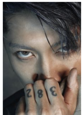
MIYAVI – NO SLEEP TILL TOKYO